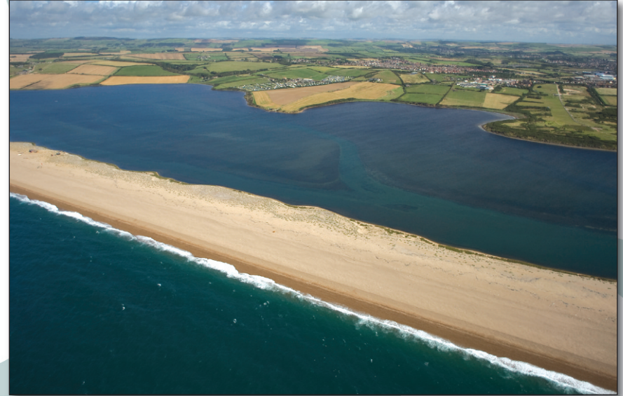
The seventeen-mile thread of shingle which makes up Chesil Beach, encloses the tranquil waters of The Fleet lagoon.