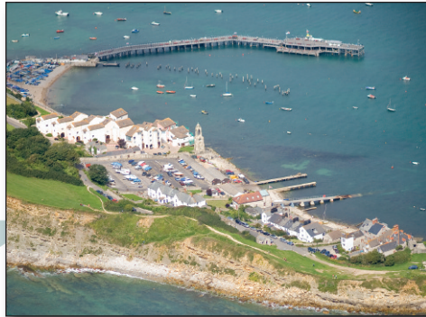
Peveril Point and the entrance to Swanage Bay.