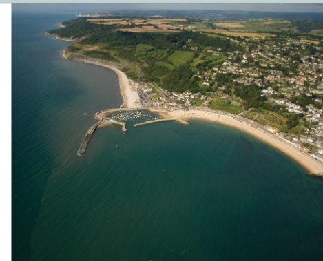
Right: The westward view, with the sweep of the famous Cobb around the harbour.