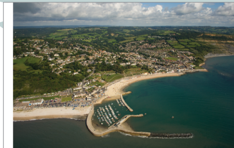
The harbour at Lyme Regis looking east towards the landlip in an area known as The Spittles.