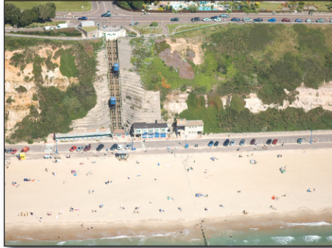
One of the three cliff railways in Bournemouth.