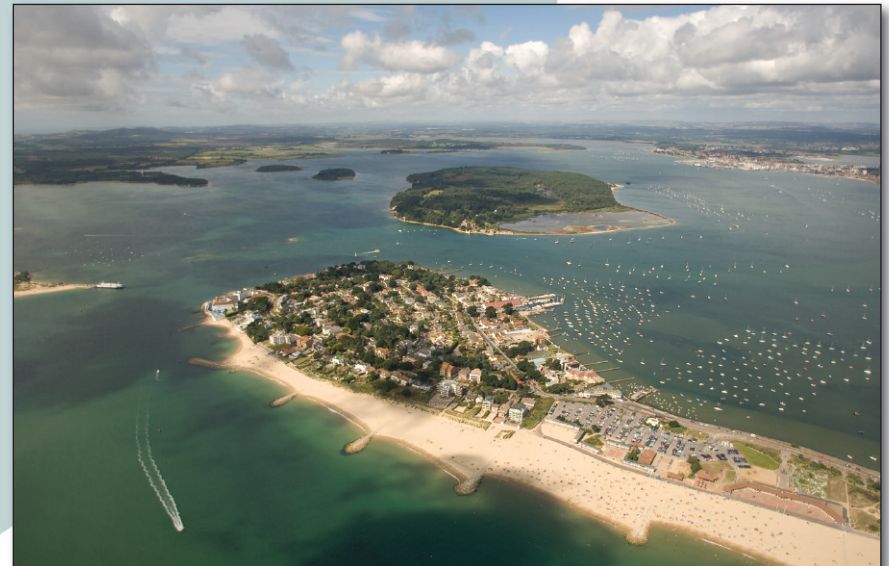
Looking west into Poole Harbour over Sandbanks, with Brownsea Island centre.