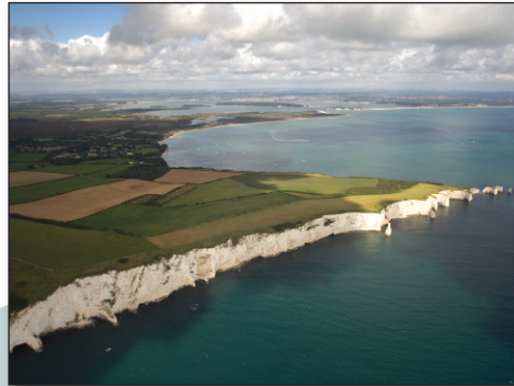
From Swanage Bay, the view north over Ballard Down towards Poole Harbour.