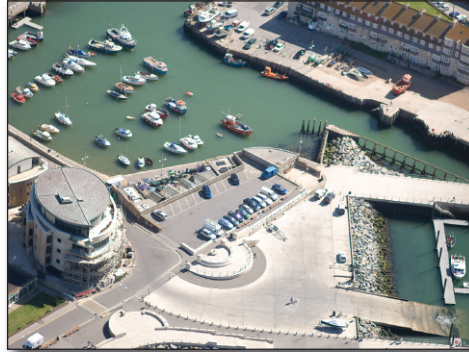
The inner harbour, West Bay.